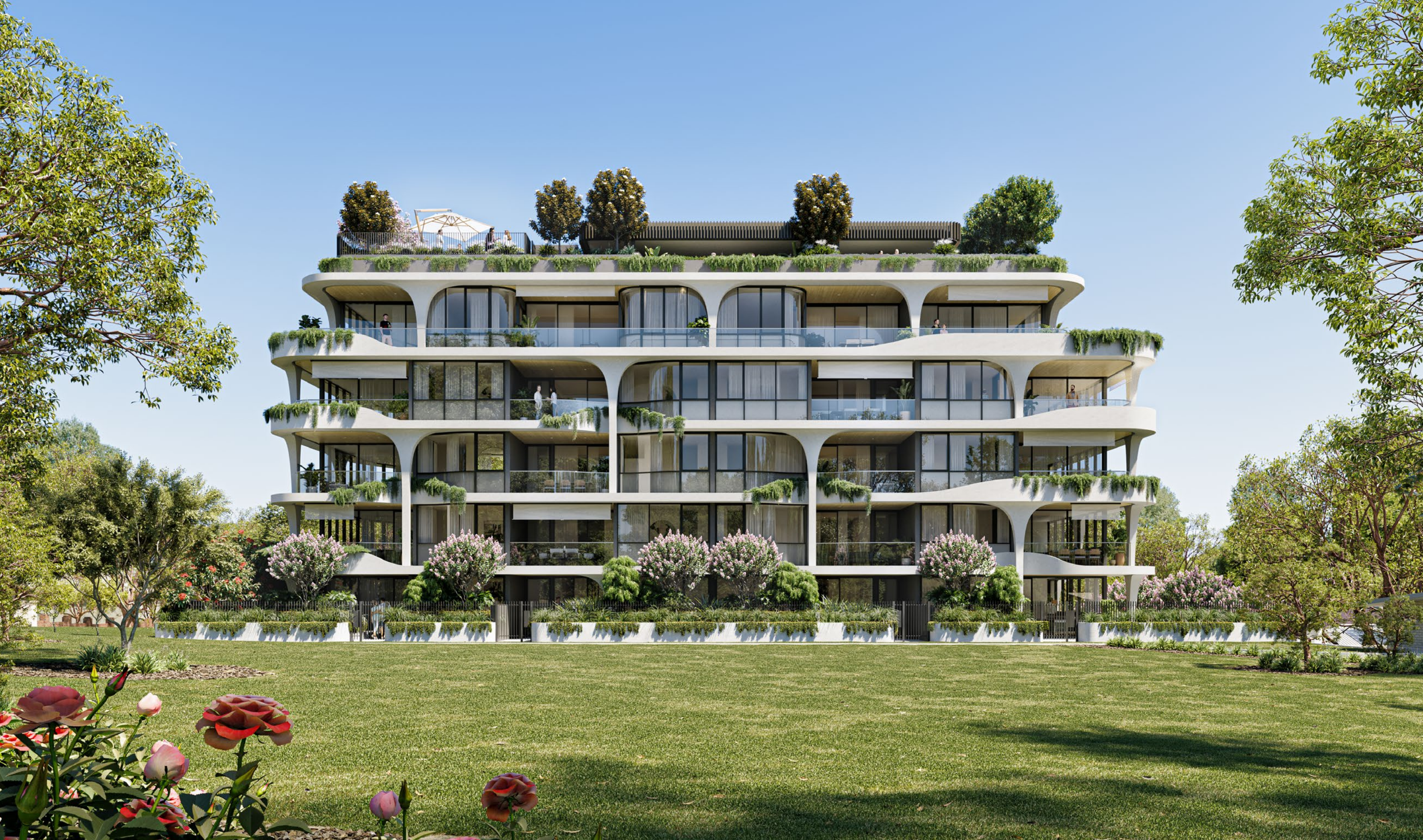
Lush planting and landscaping throughout promotes a sense of wellbeing.